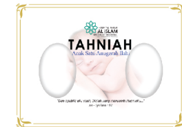
Footprint & Certificate