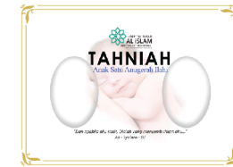
Footprint & Certificate